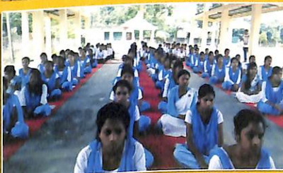
Celebration of 2nd International Yoga Day, 21st June 2016