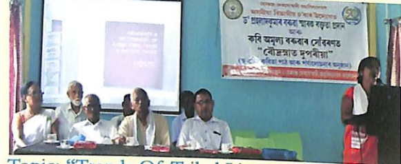
Topic: "Trends Of Tribel Literature In Assam" Date: 24th of Aug, 2016