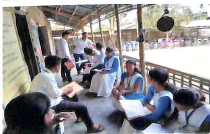
During Practice Teaching (6 th Sem. Student)

Department of Education H.C.D.G. College Nitaipukhuri