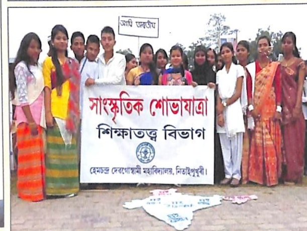
Grabbed 2 nd Prize in Cultural Rally, 'College Week 2017'.