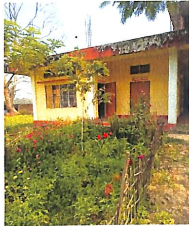
Education Department and Psychological Laboratory

A Departmental Newspaper published by the Department of Education, Hem Chandra Devgoswami College . P.O. Nitaipukhuri , Dist.- Sivasagar (Assam)