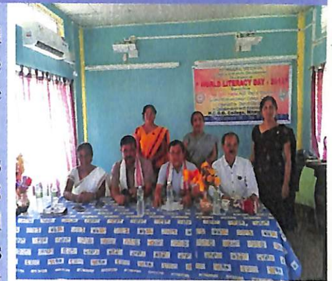
Picture of Observing World Literacy Day, 2018