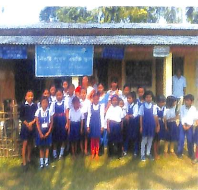
Field Survey at Nitaipukhuri M.V. School by students