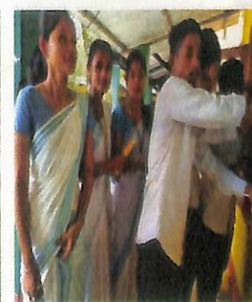
6th semester students, 2018