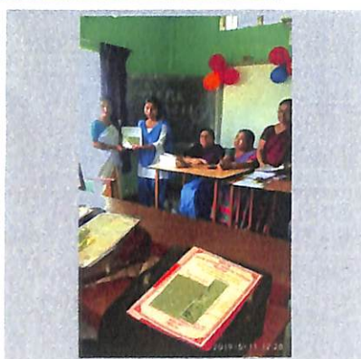
Junior students bid Farewell to 6th semester students