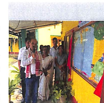
Inauguration of Ankuran