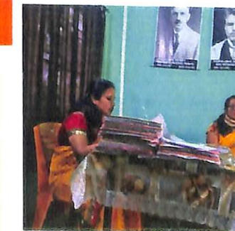
External Examiner check the Project reports and Practical books

❑ Laboratory Practical: The laboratory practical examination of 6 th semester was held on 11 th May, 2019 in the presence of external examiner from Gorgaon College.