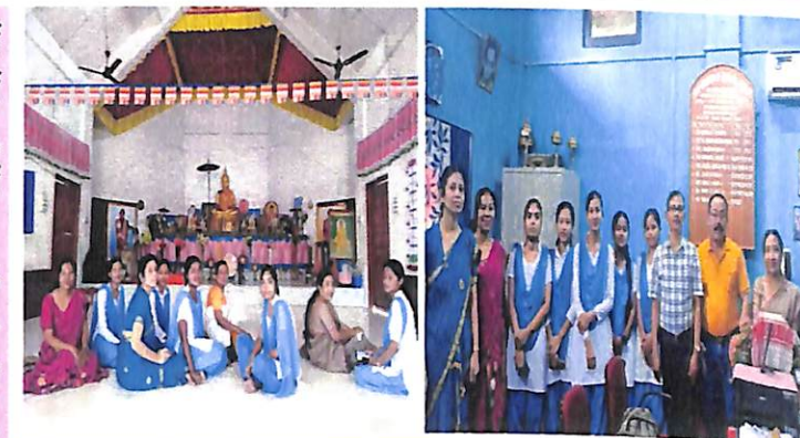
At Buddha Monastery and Cultural Centre With Pradhan Adhyapak

Students of 6 th semester had completed and submitted Project Report in the context of Course DSEED 604. They have surveyed at Chalapather Shyam Village situated in Charaideu on 2 nd June, 2022.