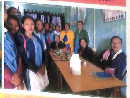
B.A. 2 nd semester students