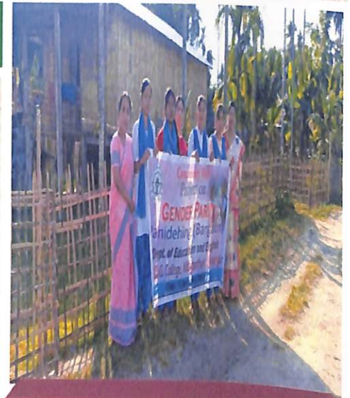
Community visit project on 'Gendar Parity' at Bargaon

Community visit project was done by 6 th semester students of Education and English department on 'Gendar Parity' at Bargaon, Panidehing on 1 st January, 2022. The village is habitant by Deori community people in a eco-friendly environment near the bank of Dehing river about 5 k.m. distant from Nitaipukhuri chariali. They have administered self prepared questionnaires to the villagers and noticed the changes in girls and women regarding social participation and education.