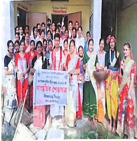
Cultural rally participated by students of each semester