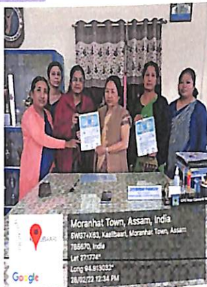
Signed MoU with Moran Mahila Mahavidyalaya, Charadeu on 28/02/2022