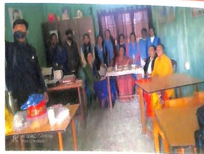
B.A. 4 th semester students