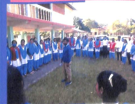
students with members of Pathikrit