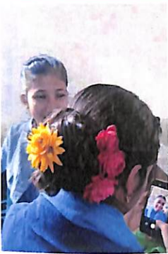
Students have participated in Hair design competition in college week