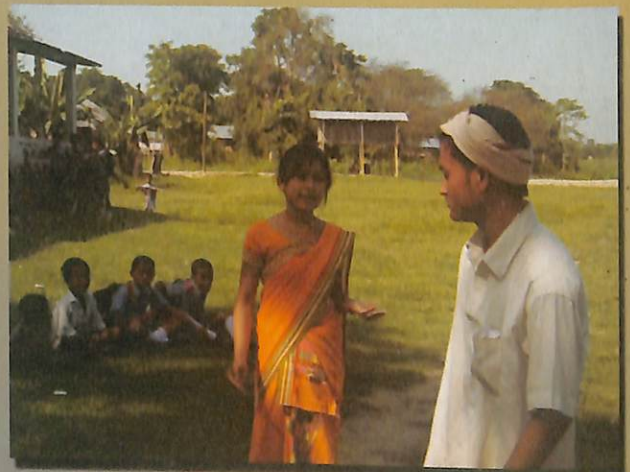
Street Drama : Live, Let Live.