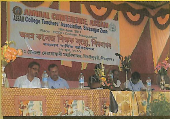
Annual Conference of ACTA, Sivasagar Zone on 16th June, 2011.