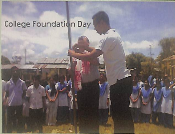
College Foundation Day